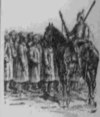
Träger beim Gefangenentransport.

Humorous piece about the role of a war correspondent or spy.