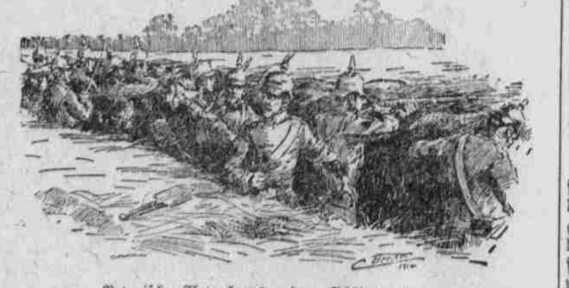
Spanische Chebanlegens im Schillingraden.

Continuation of the article on ship colors, mentioning historical and practical considerations.