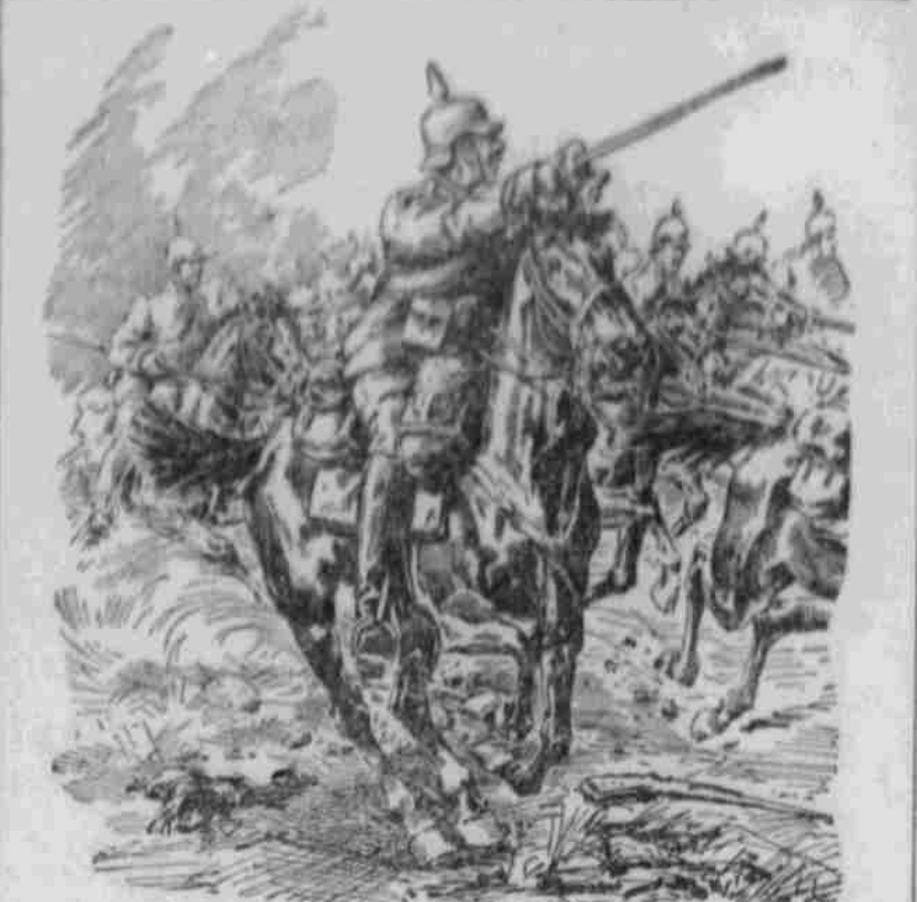
Attade der Garde-du-lors.

Text accompanying the illustration, likely a poem or short story related to the soldier.