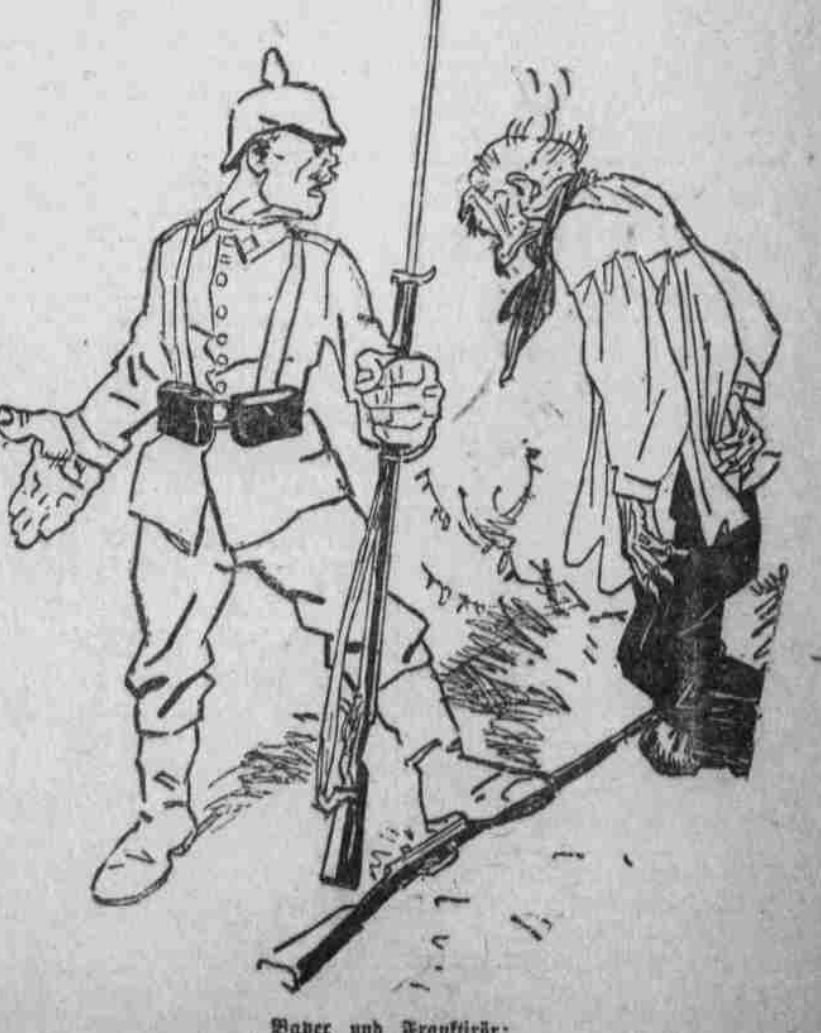
Wader und Frankfurter: Was is da ispi liaba, a Kusl' oda a Waisgn?