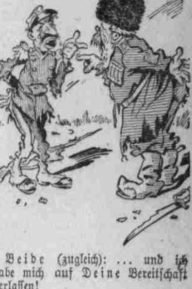
Beide (zugleich): ... und ich habe mich auf Deine Bereitschaft verlassen!

Humorous piece about the Hindenburg and military life, possibly a parody.