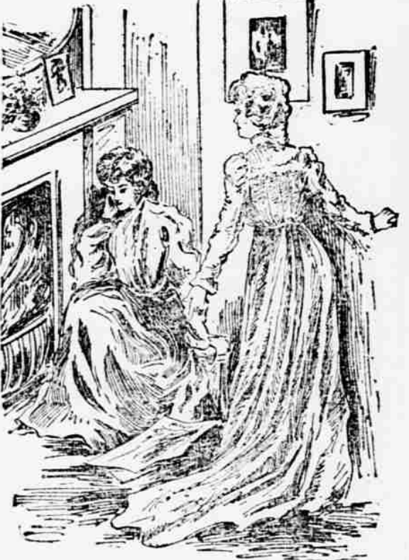
"WHY DID YOU MANAGE SO BADLY?"

"Celia," cried Lady Margaret, darting into the room, "Geoffrey says we must be one soul, because our eyes—"