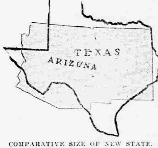
COMPARATIVE SIZE OF NEW STATE.

New Mexico shipped last year 200,000 head of cattle and 30,000,000 pounds of wool. It is traversed by three transcontinental railroads. The territory is rich in coal, iron and lumber, as well as the more valuable minerals, and it is claimed that when the waters now wasted are