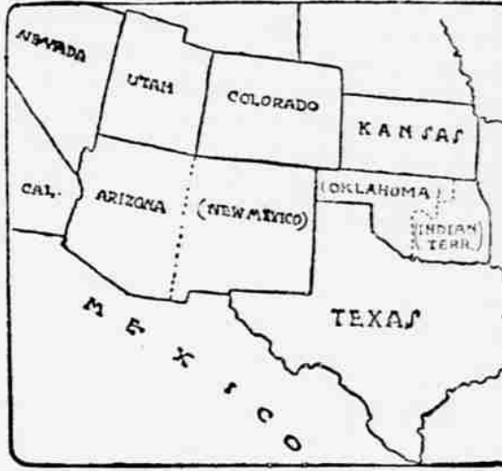
THE PROPOSED NEW STATES.

In the Indian territory there are only about 70,000 Indians and more than 400,000 white men. About two-fifths of the latter are from the south. There is less illiteracy than in many of the States.