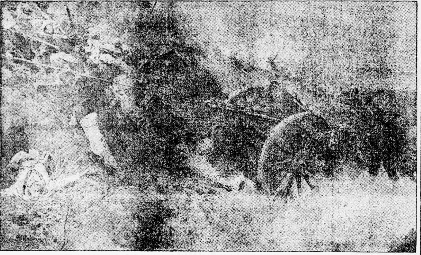
JAPANESE POSSESSING A COMMANDING HEIGHT NEAR PORT ARTHUR.

the attacking columns, and its banks than to the enemy. And whenever the The British steamer Chenan was