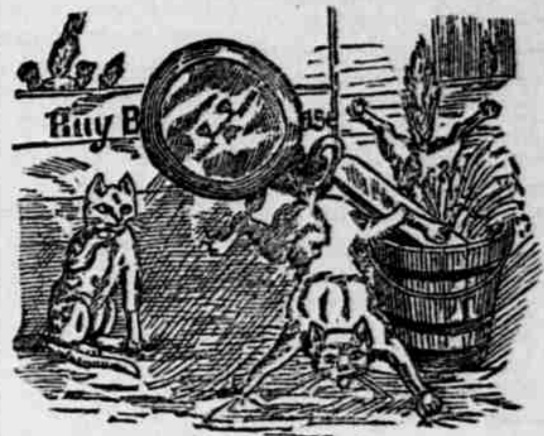
It is! It is!