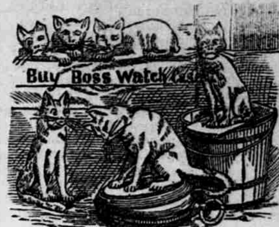
Is it a Boss Case!