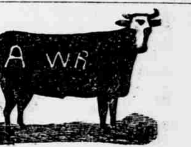
W. N. PROCTOR.

McCook, Neb. Ranch 4 miles south-east, on Republican river. Stock branded with a bar and lazy on left hip. 2-5