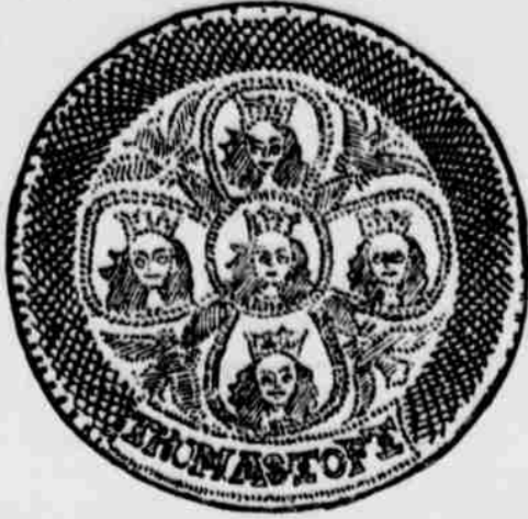
Toft Dish Given to Pennsylvania Museum.