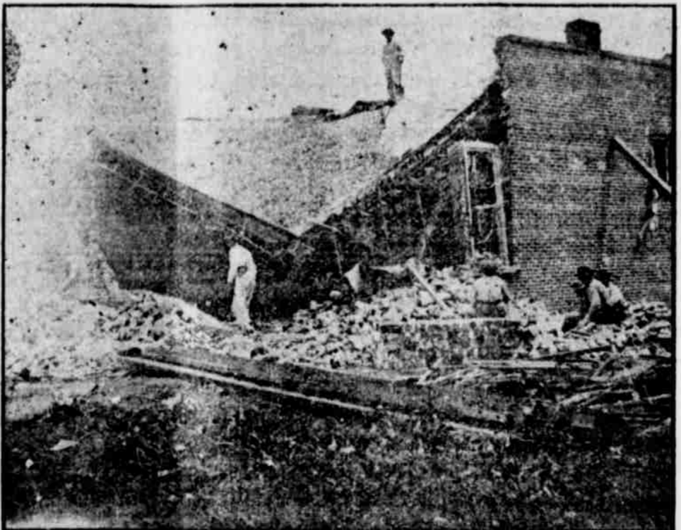
Rear of Earle Gilbert's Brick Store Building