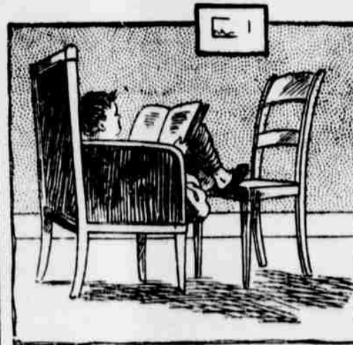
The Heart-to-Heart Talk.

"Remember that I should like to visit a great many other little boys