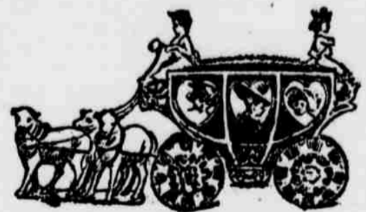
An Old English Coach.

A strikingly pretty valentine that is fraught with meaning but unaccompanied by verses is a splendid reproduction of an old English coach, cor