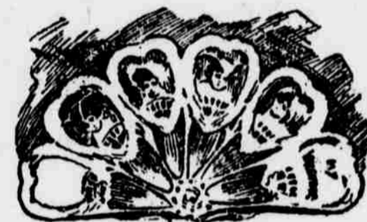
A Valentine Fan.

Though not as unusual as the coach, a fan valentine made of a series of heart-shaped frames inclosing pretty