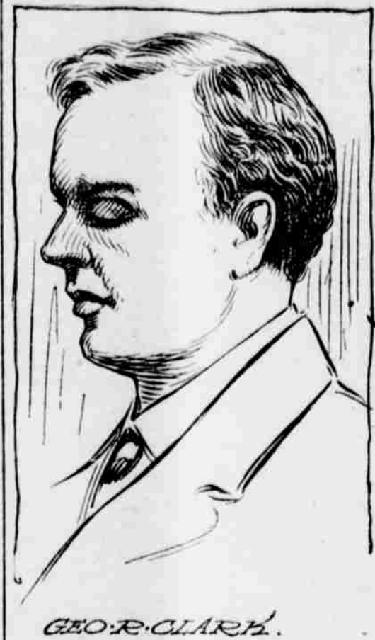
set with many difficulties, he attained high honors.