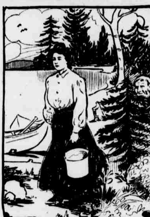
From Behind a Low Spruce One Evil Sinister Eye Watched Her.

while Angle and Chip waited almost breathlessly on the cabin piazza. A stout, bare-headed Indian, clad in white man's raiment, was paddling. He glanced at the two awaiting him at the landing, with big black, emotionless eyes, and then up to the cabin.