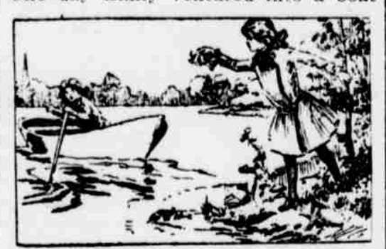
A Friend in Need.

Near by was a beautiful lake with a tiny island right in the center of it. One day Emily ventured into a boat