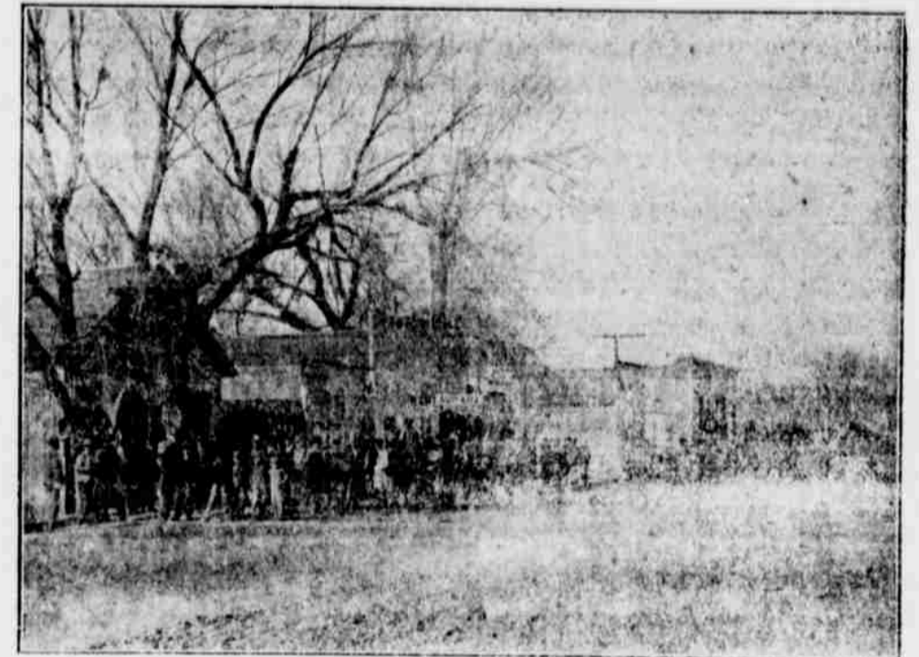
Post Cards of these and other Views at Postoffice Bookstore