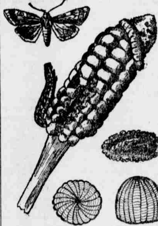
THE CORN WORM.

"The good corn farmer may thus escape with a profitable yield under insect attacks which will leave his less intelligent or less careful brother in debt after his crop is harvested. This is not merely because the vigorous plant will easily support an amount of injury under which the unthrifty