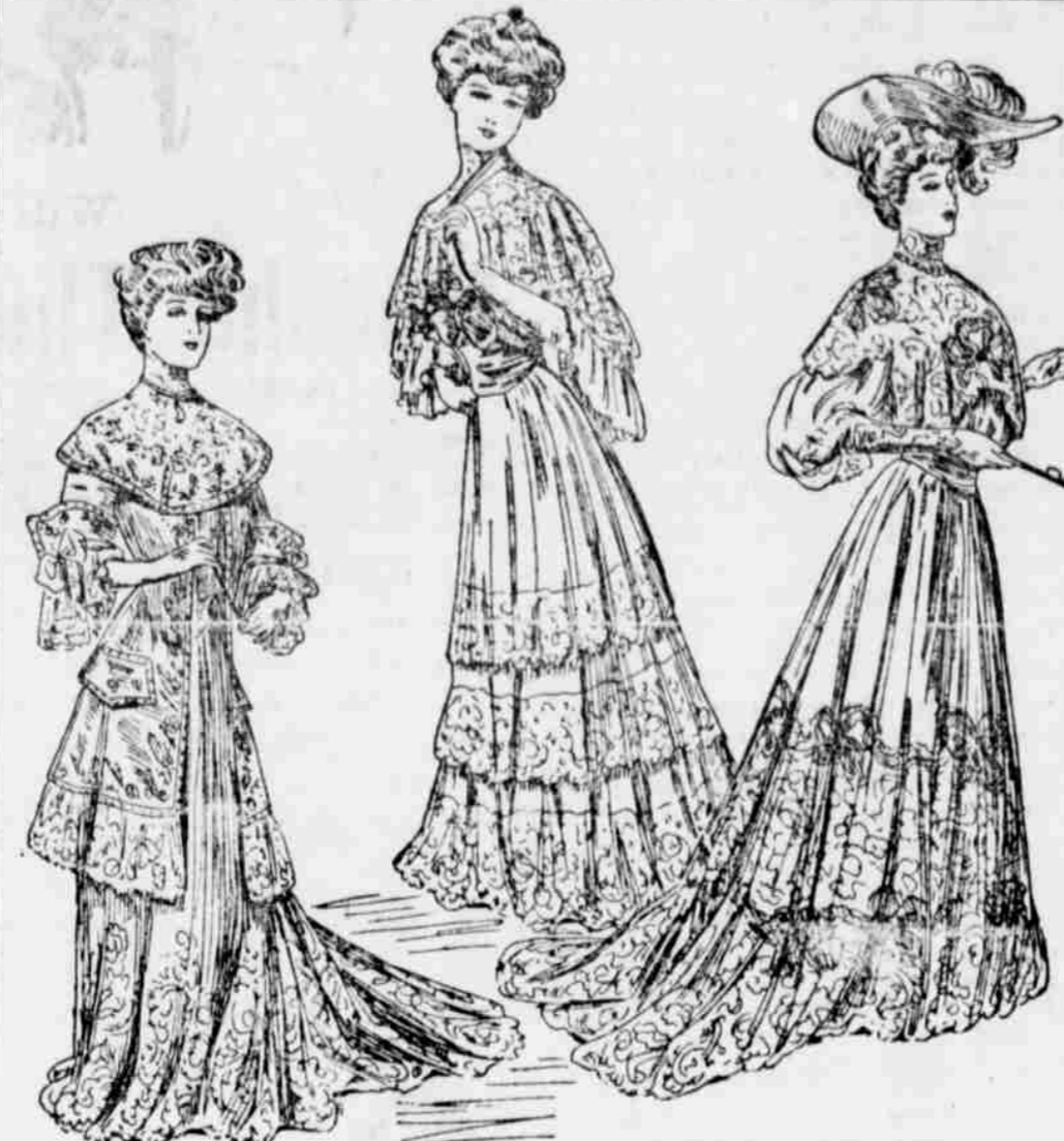
BEDIGHT WITH LACE AND EMBROIDERY.

Pearl gray will be worn much in the evening, silver gray being good style for