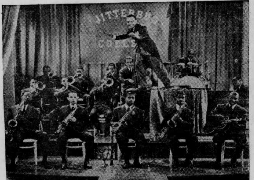
LUCKY MILLINDER & HIS ORCHESTRA

Tickets On Sale at Johnson Drug Store and AMVETS Club Admission—Advance Ticket $1.50 plus tax—At Door $1.75 plus tax.