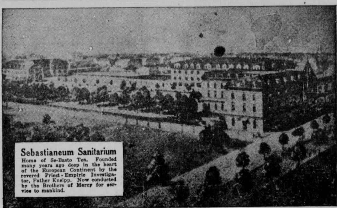
Sebastianeum Sanitarium Home of Se-Basto Tea. Founded many years ago deep in the heart of the European Continent by the revered Priest-Empiric Investigator, Father Kneipp. Now conducted by the Brothers of Mercy for service to mankind.