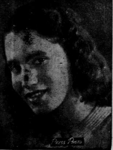
LOYOLA PSYCHIATRY STUDENT