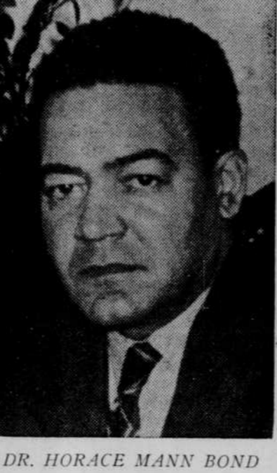
DR. HORACE MANN BOND

Evanson, Ill., April 10 (ANP) —The bulletin of the Garrett Biblical Institute Summer School, released this week, announced that Dr. Horace Mann Bond, president of Fort Valley State College, Georgia, will conduct a course in "The Negro in American Life" during the 1944 summer school.