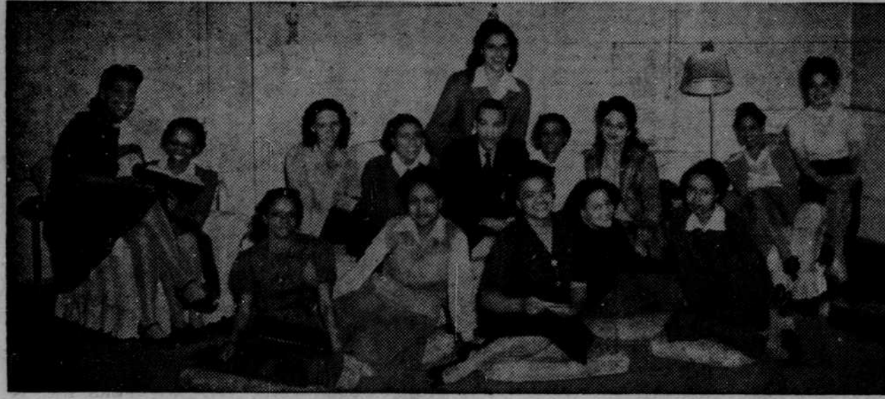
NO DULLNESS HERE—SOCIAL WORK STUDENTS RELAX