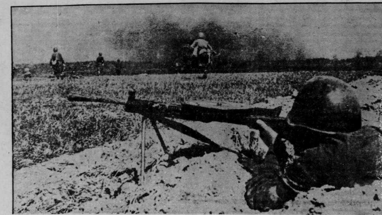
RUSSIA—Red infantry fighters attack Nazis in the Don arch, west of Stalingrad. Latest reports say that the Soviets are developing their gains in the Surovikino area, 90 miles west of Stalingrad after punishing tank battles. Although many Nazi troop and transport planes still manage to penetrate the area, the number is being lessened.