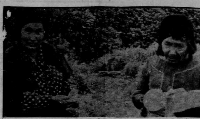
PIXPAGE—Aleut natives pictured on Attu Island, weaving their famous baskets. Japanese forces have made landings on Attu and on Kiska Island, and apparently are establishing a base at the latter. Attu is 475 miles west of Kiska, which is 589 miles west of Dutch Harbor, in the Aleutian chain of islands that stretches out from Alaska toward Japan.