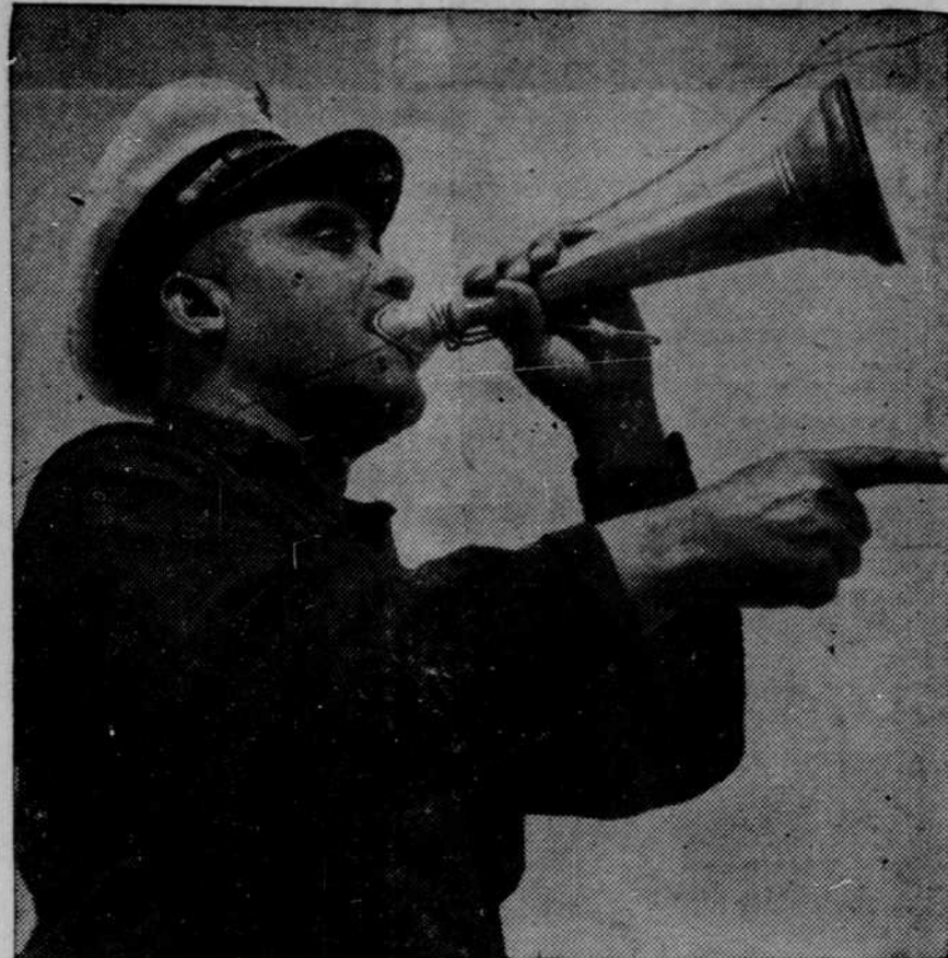
The Pea Island U. S. Coast Guard Surf Station customarily has a crew of 8 or 9 men. The crew has consisted of Negroes since establish-

ment of the station in the 1870's. Because all vessels going up and down the coast come close in as they round Cape Hatteras, and because this section is one of dangerous storms, the Coast Guard Surf Stations between Hatteras and Norfolk year in and year out have calls for help. War conditions now have greatly intensified the need for close watch along the coast and have added to the peace-time average of numbers of rescues.