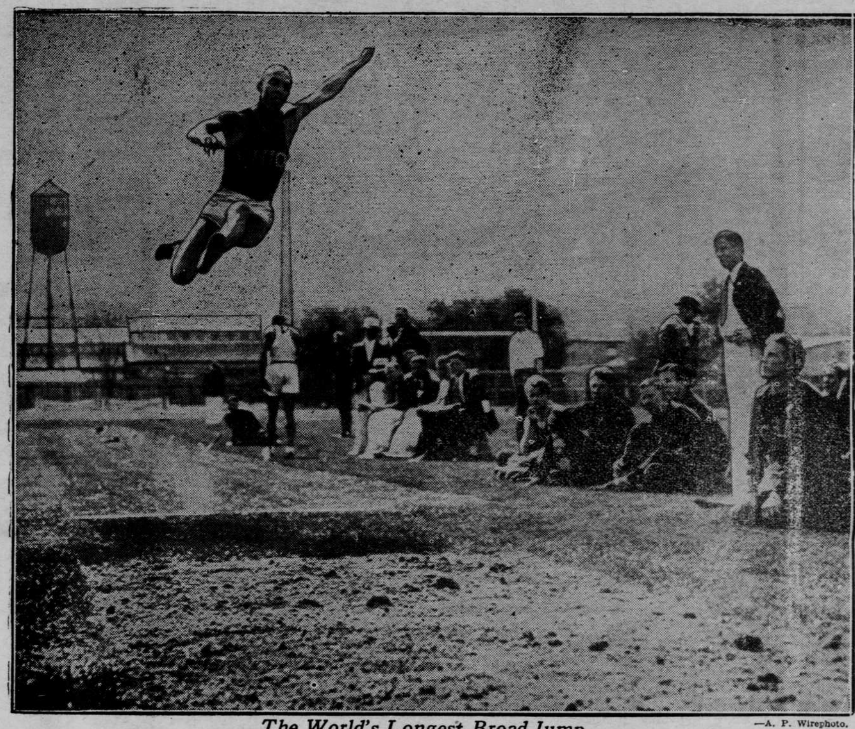
The World's Longest Broad Jump