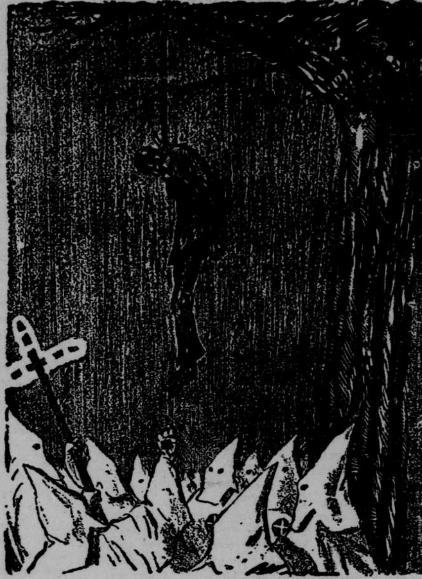
(Reprinted by permission, from Today, of December 16, 1929)

Another masked hideous, act of a bunch of heathens burning a human being alive. Less than 10 days after the burning they discovered that they had burned the wrong man. This happened in St. Joseph, Missouri.