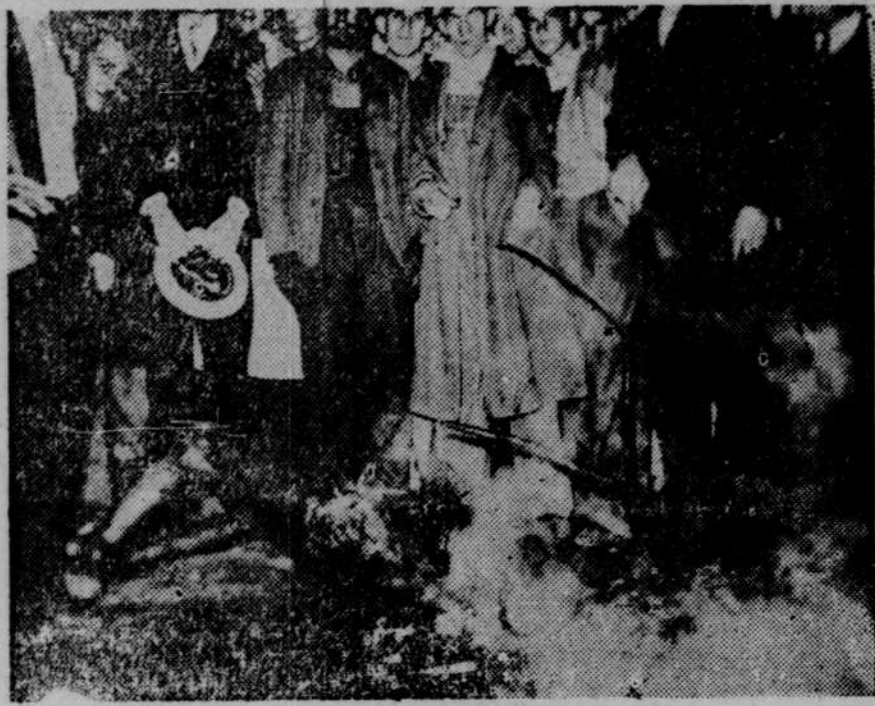
DO WE NEED A FEDERAL ANTI-LYNCH LAW

But the object of these pictures is to make your red blood boil, if you have any, so you will help to put a stop to these Unamerican, inhuman, horrible acts. If you don't want to look upon these kind of pictures send a telegram to the President today, ask him to use his influence today with Congress to force a vote on the anti-lynch bill. Walter White, secretary of the N. A. A. C. P. says he has enough votes to pass this bill now but the enemies are trying to pigeon hole this bill. Masked pressure must be used to force this bill to the floor for a vote. Send the President a telegram today, also your Congressman, and Senator, and demand action now or refuse to listen to political oratory for the coming primary election.