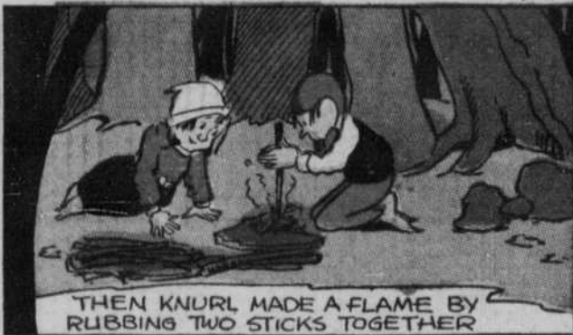
THEN KNURL MADE A FLAME BY RUBBING TWO STICKS TOGETHER