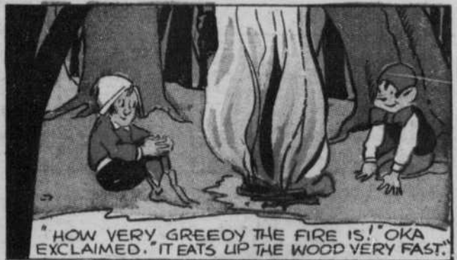
"HOW VERY GREEDY THE FIRE IS!" OKA EXCLAIMED. "IT EATS UP THE WOOD VERY FAST."