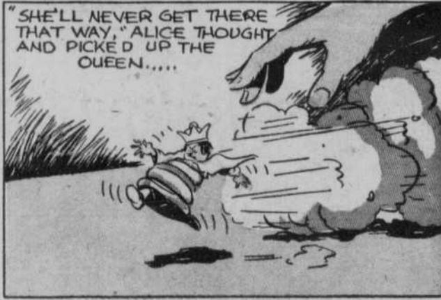
"SHE'LL NEVER GET THERE THAT WAY," ALICE THOUGHT AND PICKED UP THE QUEEN.....