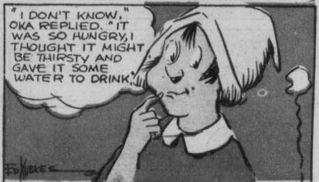
"I DON'T KNOW," OKA REPLIED. "IT WAS SO HUNGRY, I THOUGHT IT MIGHT BE THIRSTY AND GAVE IT SOME WATER TO DRINK."