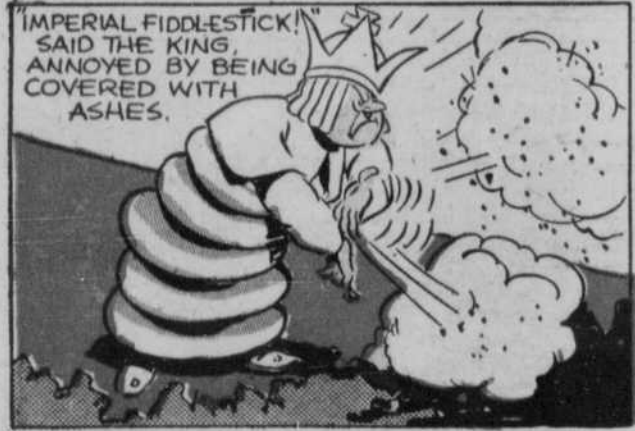
"IMPERIAL FIDDLESTICK!" SAID THE KING, ANNOYED BY BEING COVERED WITH ASHES.