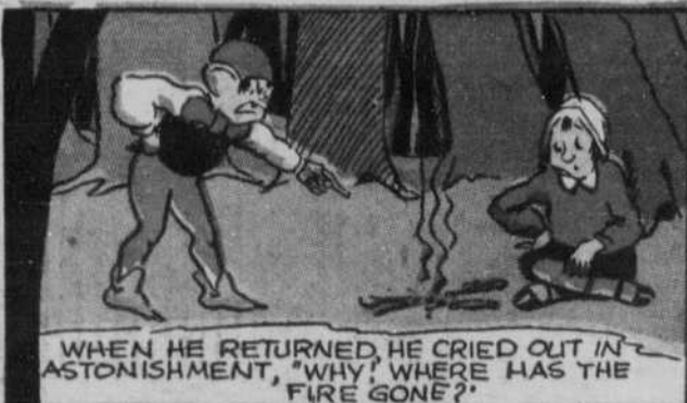
WHEN HE RETURNED HE CRIED OUT IN ASTONISHMENT, "WHY? WHERE HAS THE FIRE GONE?"