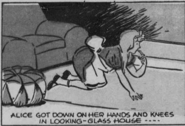
ALICE GOT DOWN ON HER HANDS AND KNEES IN LOOKING-GLASS HOUSE ----