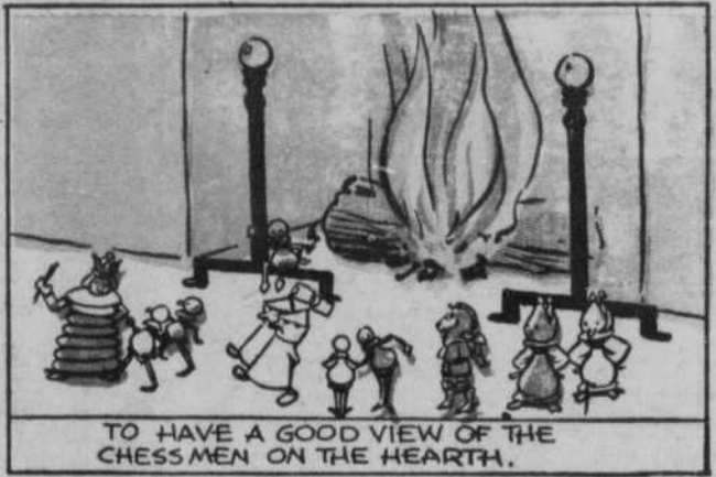
TO HAVE A GOOD VIEW OF THE CHESS MEN ON THE HEARTH.