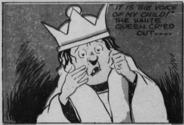
IT IS THE VOICE OF MY CHILD! THE WHITE QUEEN CRIED OUT----