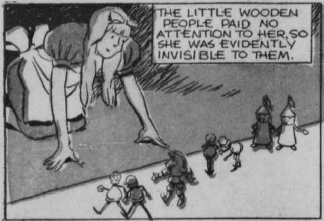
THE LITTLE WOODEN PEOPLE PAID NO ATTENTION TO HER, SO SHE WAS EVIDENTLY INVISIBLE TO THEM.