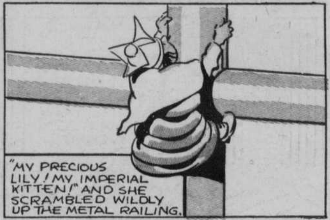
"MY PRECIOUS LILY / MY IMPERIAL KITTEN!" AND SHE SCRAMBLED WILDLY UP THE METAL RAILING.