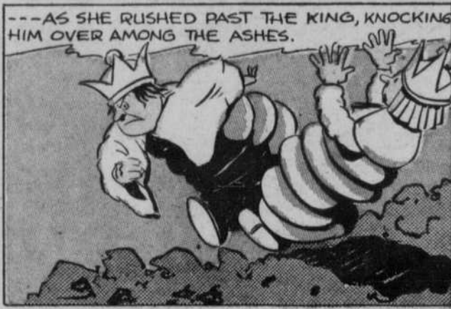
---AS SHE RUSHED PAST THE KING, KNOCKING HIM OVER AMONG THE ASHES.