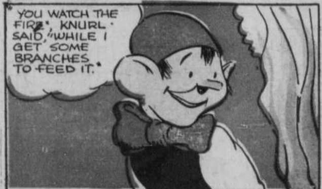
"YOU WATCH THE FIRE," KNURL SAID "WHILE I GET SOME BRANCHES TO FEED IT."