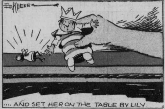
... AND SET HER ON THE TABLE BY LILY.