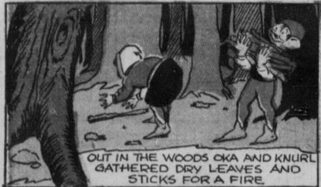
OUT IN THE WOODS OKA AND KNURL GATHERED DRY LEAVES AND STICKS FOR A FIRE.