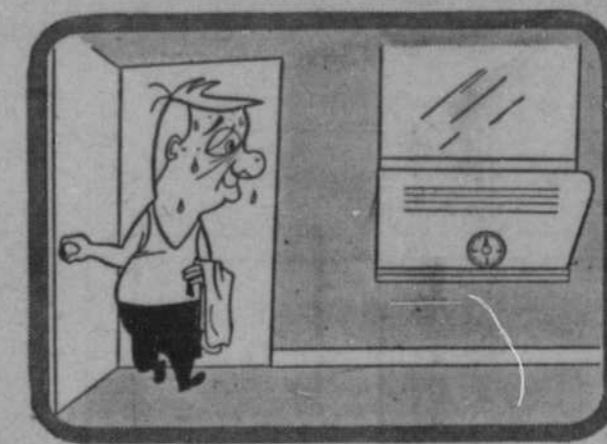
He turned on that cooler... relaxed in a chair... But he waited in vain for some nice, clean, cool air.

CALL YOUR ELECTRICAL CONTRACTOR FOR A FREE ESTIMATE ON FULL HOUSEPOWER