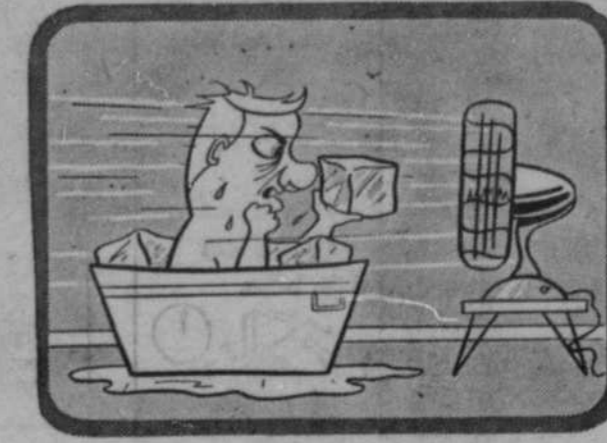
He turned on that cooler... relaxed in a chair... But he waited in vain for some nice, clean, cool air.