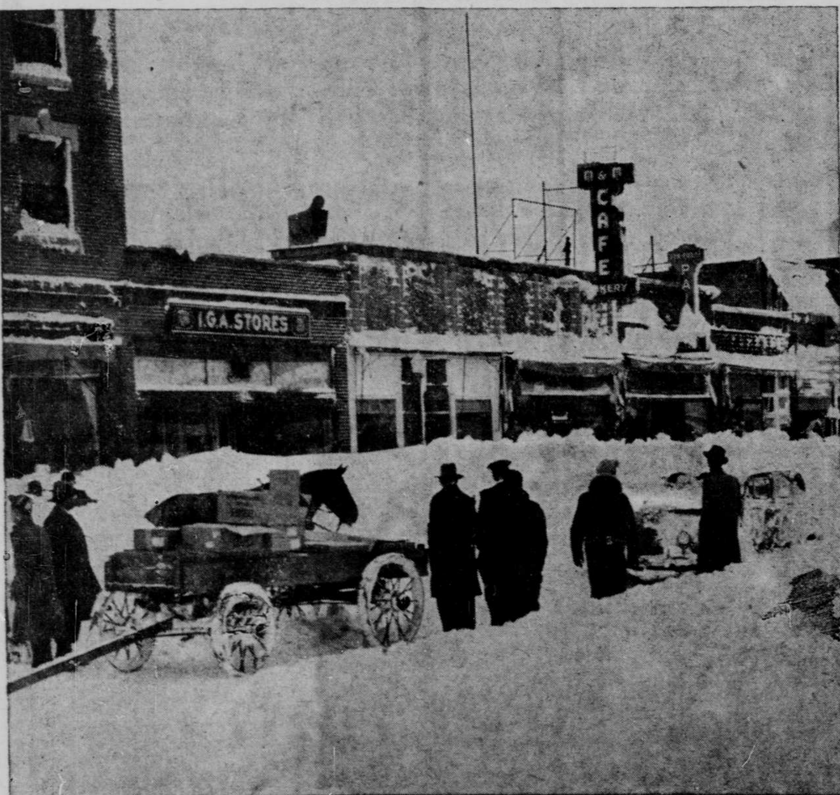
Remember 1948-'49? This Golden hotel corner scene following a big snow and blow is tossed in for readers to make their own comparisons.