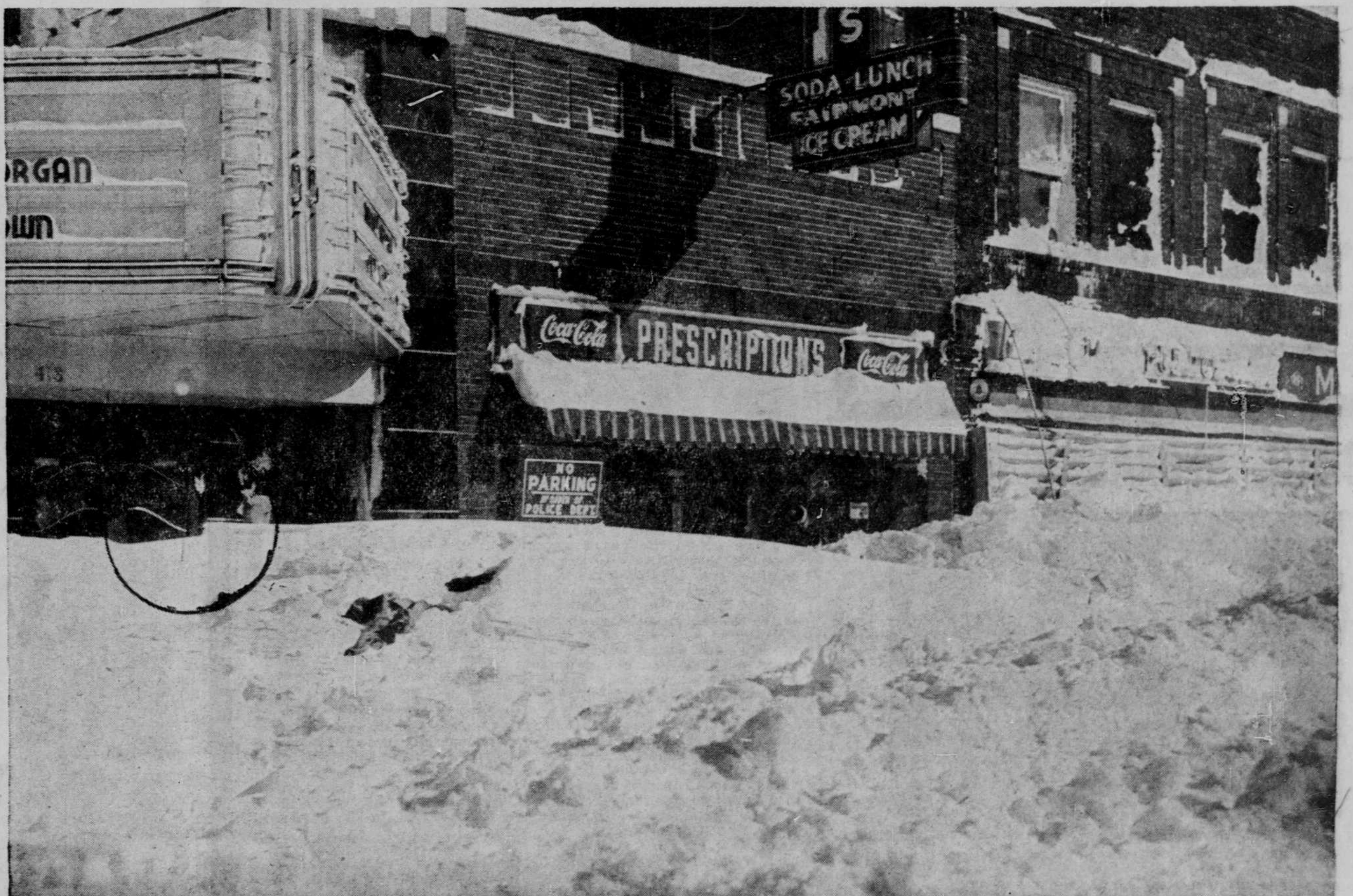
"No Parking" sign went unheeded by weather-beaten wayfarers who gave up Thursday before peak of storm. All parking stalls were filled and machines buried. (Note circle which points out thin auto antennae.) Jacket atop car belongs to owner—an Alaskan—who has started to dig.