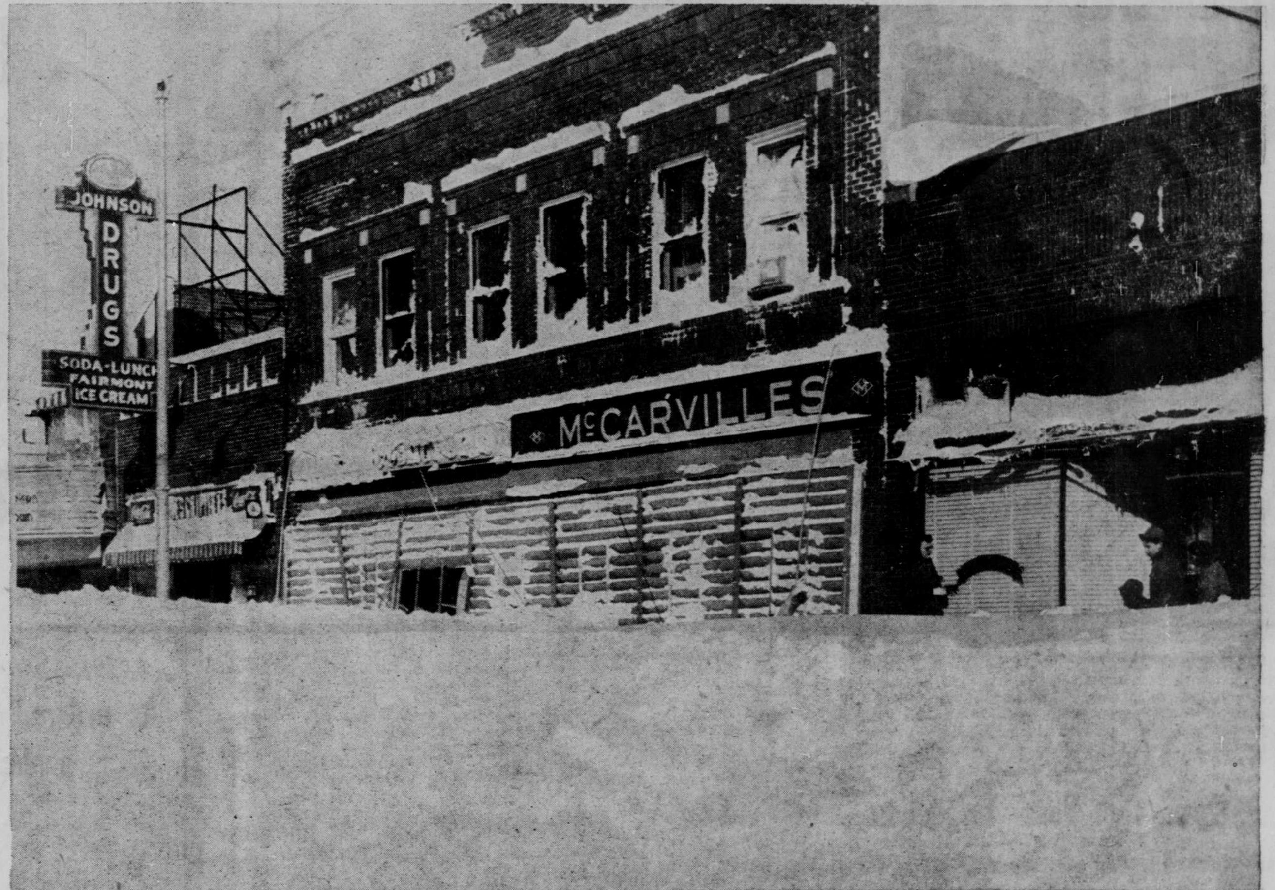
Intense weight of snow forced collapse of 50-foot aluminum canopy at Consumers Public Power building. The marquee buckled during the height of the storm, no one was hurt, plate glass windows were not broken.