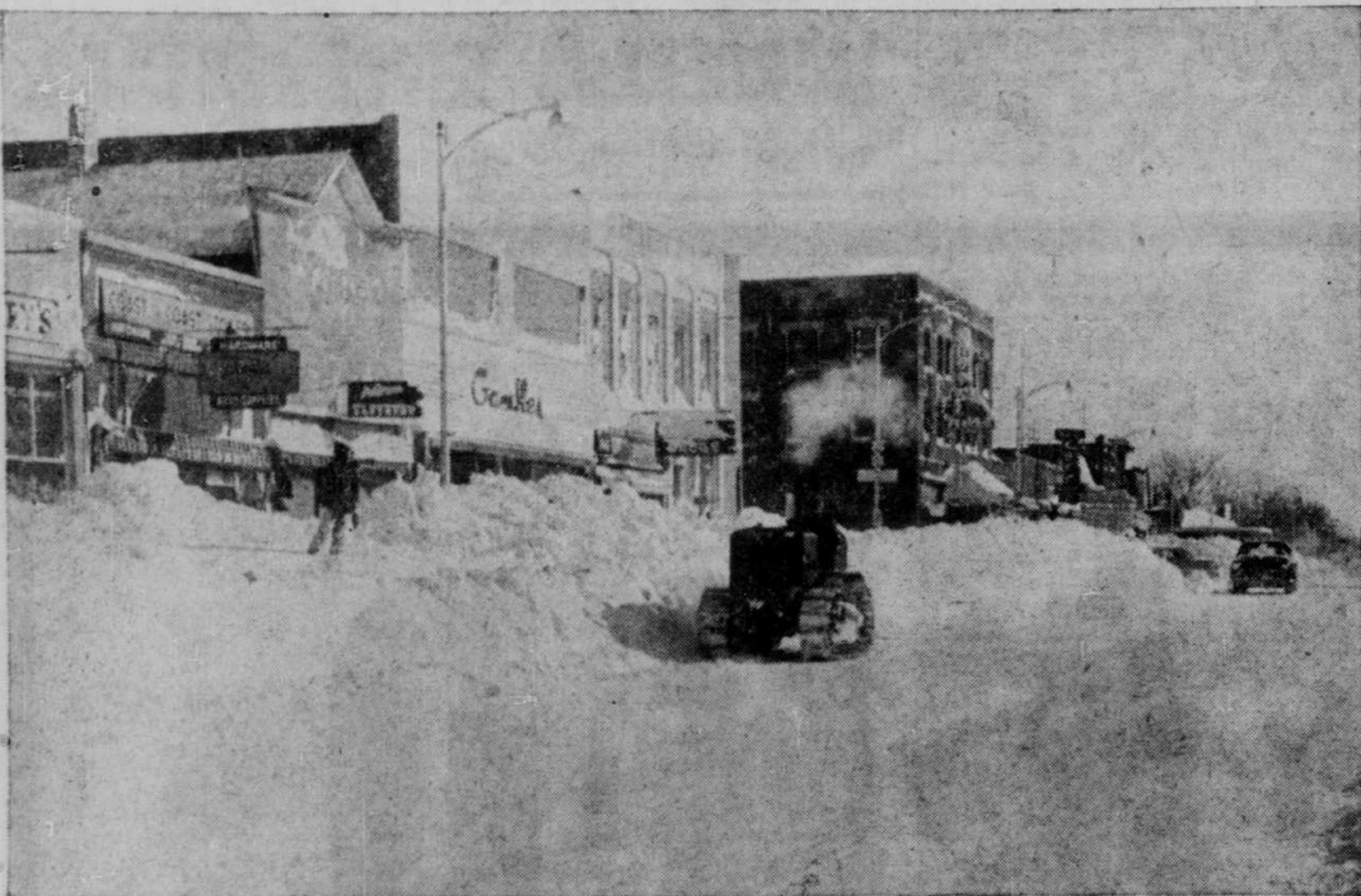
City street crews lost no time in undertaking the colossal job of snow removal. Photo looking east on Douglas street at 10 a.m., Friday.