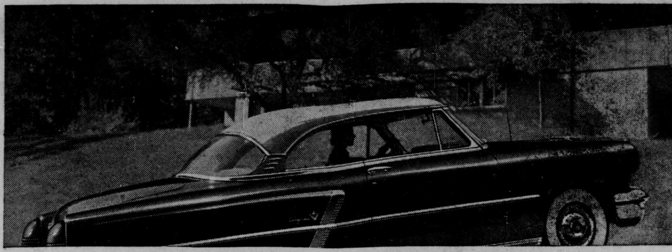
The '53 Lincoln . . . powered for modern driving, designed for modern living.