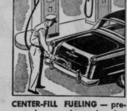
space for an extra suitcase.