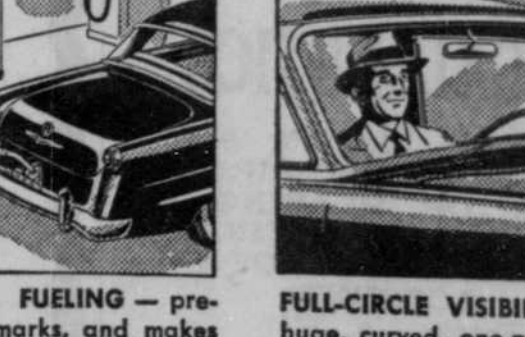
vents hose marks, and makes "filling up" easier from either side of gas pump. Shorter gas filler pipe gives you trunk

FULL-CIRCLE VISIBILITY-with huge, curved, one-piece wind-shield, a car-wide, one-piece rear window and big picture windows all around—gives you