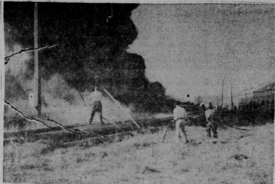
FIREMEN BATTLE POLE BLAZE.. A pile of crosote-treated poles near the railroad tracks burned in spectacular fashion on Friday, October 21. Heavy, black smoke billowed skyward for 10 minutes before the blaze was brought under control.