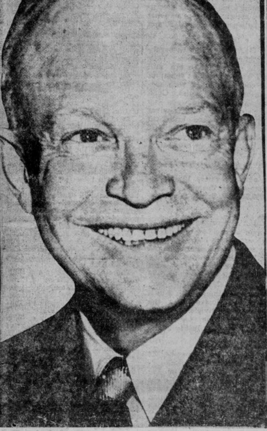
Dwight D. Eisenhower... victor over Adlai Stevenson in republican sweep.