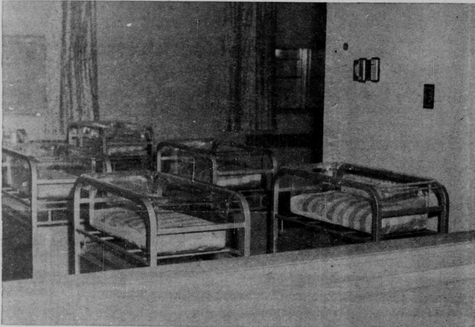
Doting new fathers will peer through this window into the nursery located at the west end of the second floor. Capacity is 12 bassinets. Each bassinet is a unit in itself with drawer space for storing clothes, blankets and diapers. Formula for baby is prepared, refrigerated and kept in a special compartment in the nursery.