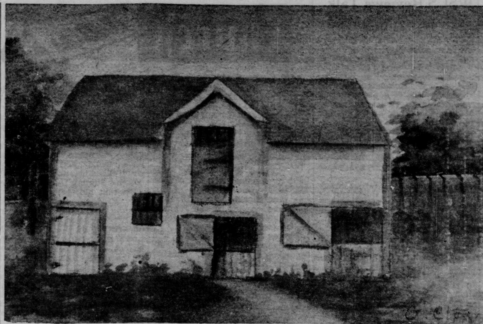
PREDECESSOR ONCE AN ART SUBJECT . . . was the subject of art students attending the O'Neill schools. A sixth grader 30 years ago turned in the above crayon sketch.