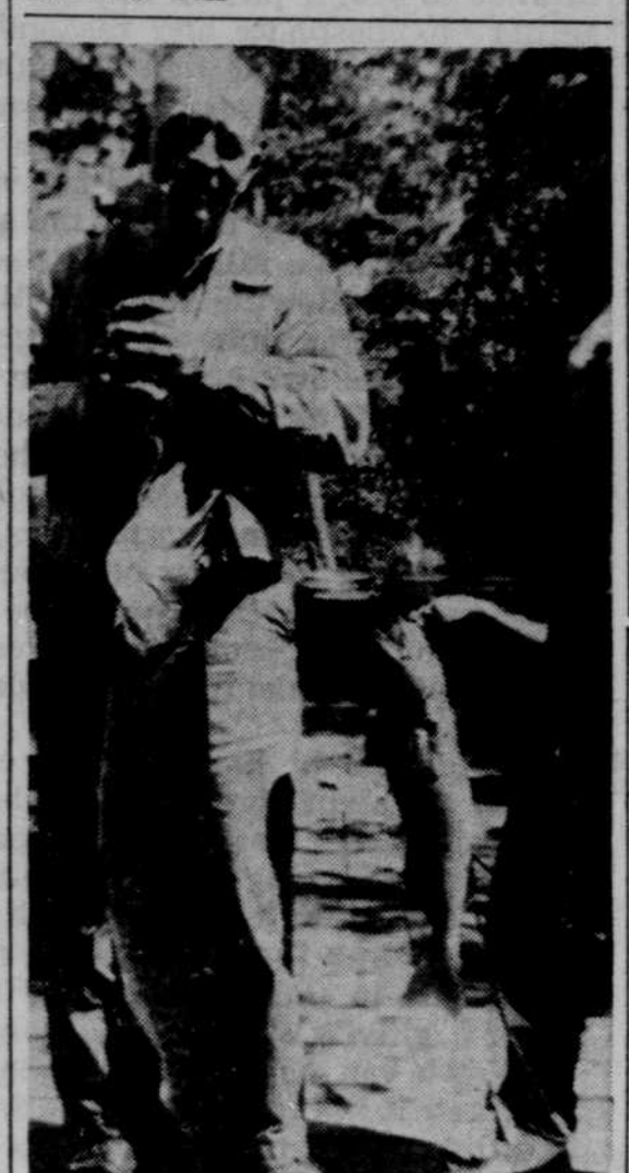
GATZ NABS BIG ONE . . . C. J. Gatz (above), O'Neill businessman, exhibits a 21-pound muskie caught recently on a Canadian fishing excursion.

Deadline Near on Deer Permits More than one thousand applications for deer permits were received by the Nebraska game commission during the past week, skyrocketing the total number of applicants for each type of permit to 2,248 for bucks and 1,560 for does. Only a few days remain before the application deadline. No applications postmarked after August 10 can be accepted. The drawing to determine the holders of the 1,500 doe permits and the 1,000 doe permits will be held Tuesday, Sept. 16 in the State House. The public is invited to attend. Nebraska's buck season gets underway December 1 and ends on the 7th.