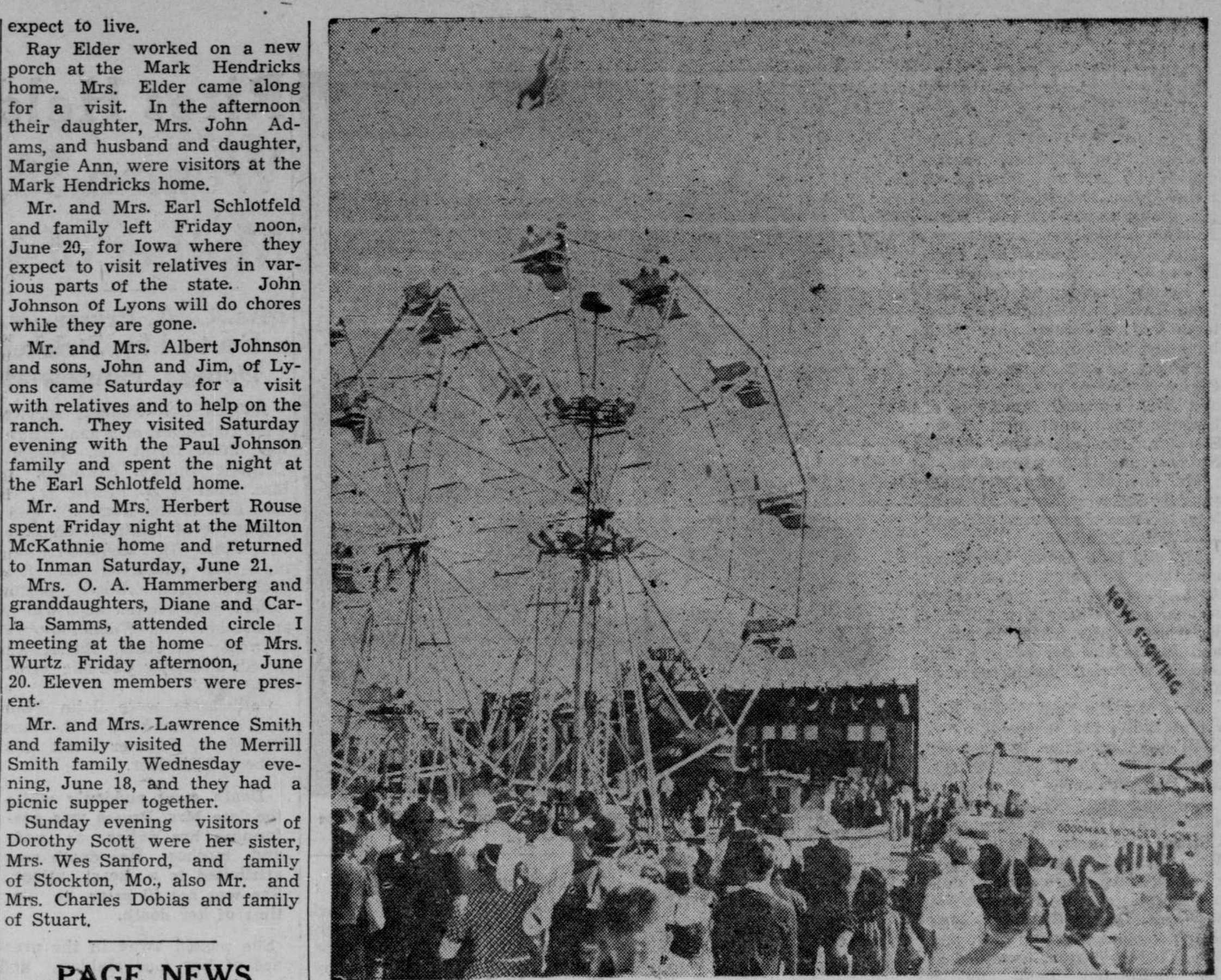
Neligh visitors will see body propelled high over ferris wheel,