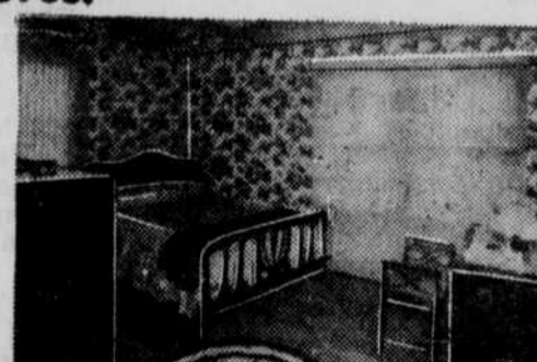
2-3 or More Bedrooms

Gracious living at its finest! It's your home — planned and decorated by you for all the beauty and comfort you desire.