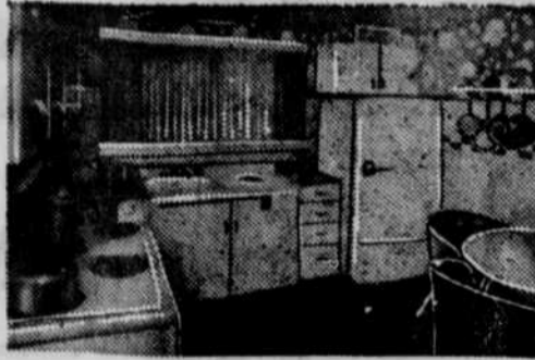
Famous Youngstown All-Steel Kitchen—

Here's the dream kitchen you've always wanted — modern, efficient, complete! And for economical home heating, an efficient furnace in the basement or utility room.