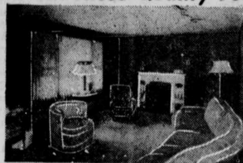
Beautiful Picture-Book Interiors

Here's the dream kitchen you've always wanted — modern, efficient, complete! And for economical home heating, an efficient furnace in the basement or utility room.