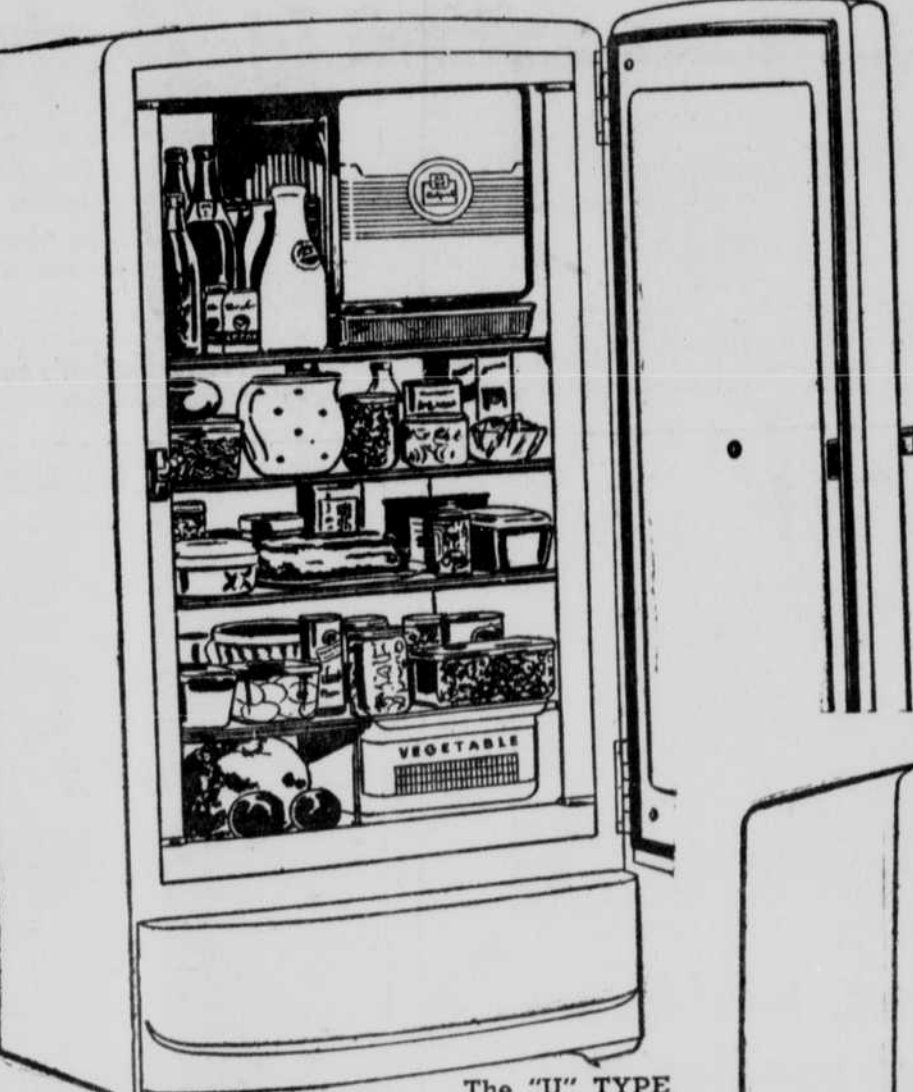
The "U" TYPE

Frankly, the question cannot be answered without first knowing the individual's present refrigeration system. For instance a family who owns a refrigerator and a home freezer doesn't have the same problem as the family who owns only a refrigerator. By the same token, a family having a refrigerator with an across top freezer is not confronted with the same problems as the family having a refrigerator equipped with the "U" type evaporator.