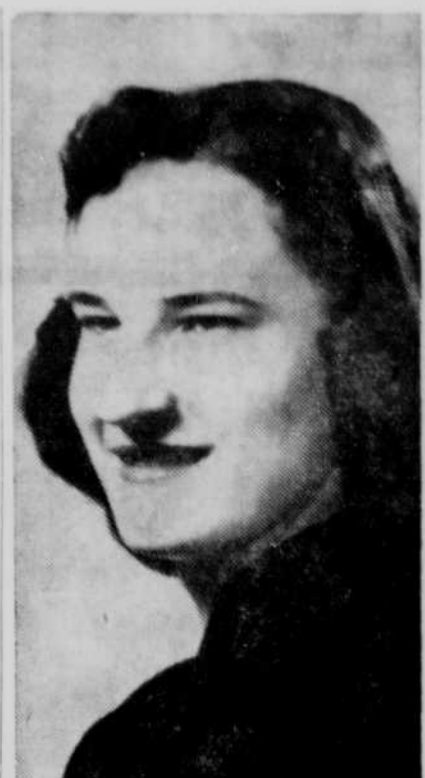
Weds in Dakota