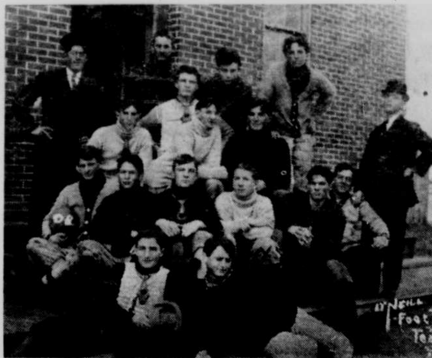
This Team Won 'Em All in '08