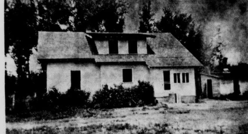
VIEW OF THE SEVEN-ROOM DWELLING This is a very fine dwelling, in excellent repair, modern in every way except furnace. Farm is located one mile off U.S. Highway 281, north-south artery

General Comment The place, located in fine Bethany community, can be all pastured, if desired, or all hay meadow—except about 20 acres under cultivation and 12 acres of alfalfa. Farm has nice lake which is maintained by good flowing well. Six flowing wells on place, providing running water in all pastures. Farm is well fenced and cross fenced for the different pastures and hay meadow. This is regarded as one of the better farms in the southern part of Holt county, producing an abundance of number one hay and providing excellent pasture.