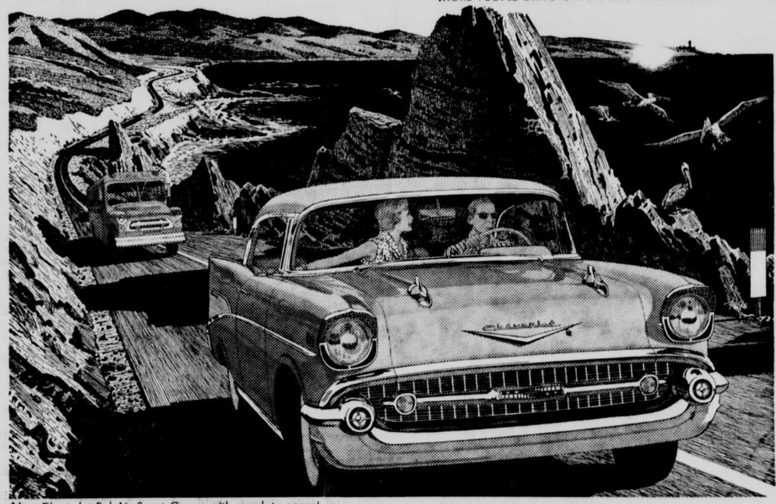
New Chevrolet Bel Air Sport Coupe with spunk to spare!