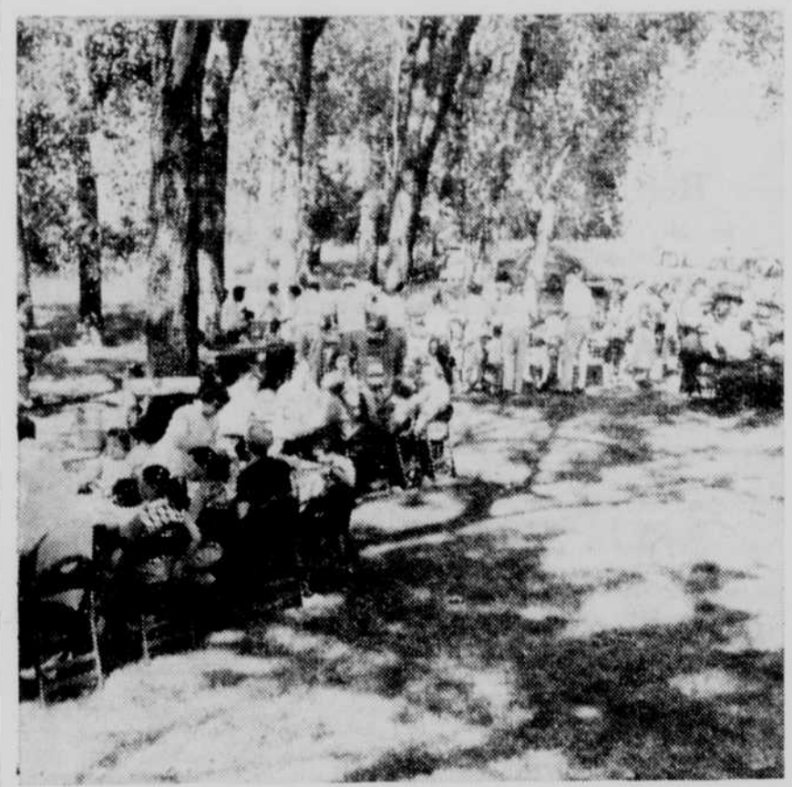
This is a view of the Holt county Knights of Columbus picnic setting. The affair took place Sunday at the Pat Corrigan grove, southwest of Emmet.