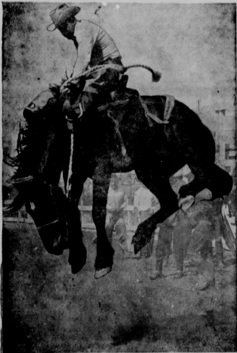
Head low, heels high, the saddle bronc bursts from the chute in a 10-second pattern of violence. Learn the factual account of the hazards and the scoring in the story that accompanies this picture).