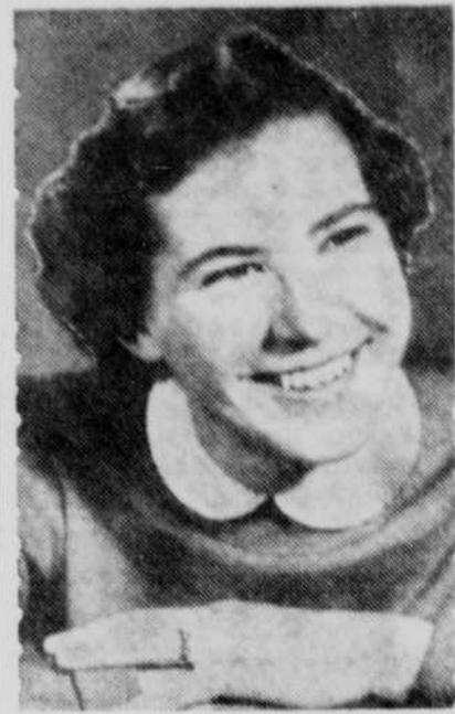
To Visit U.N.