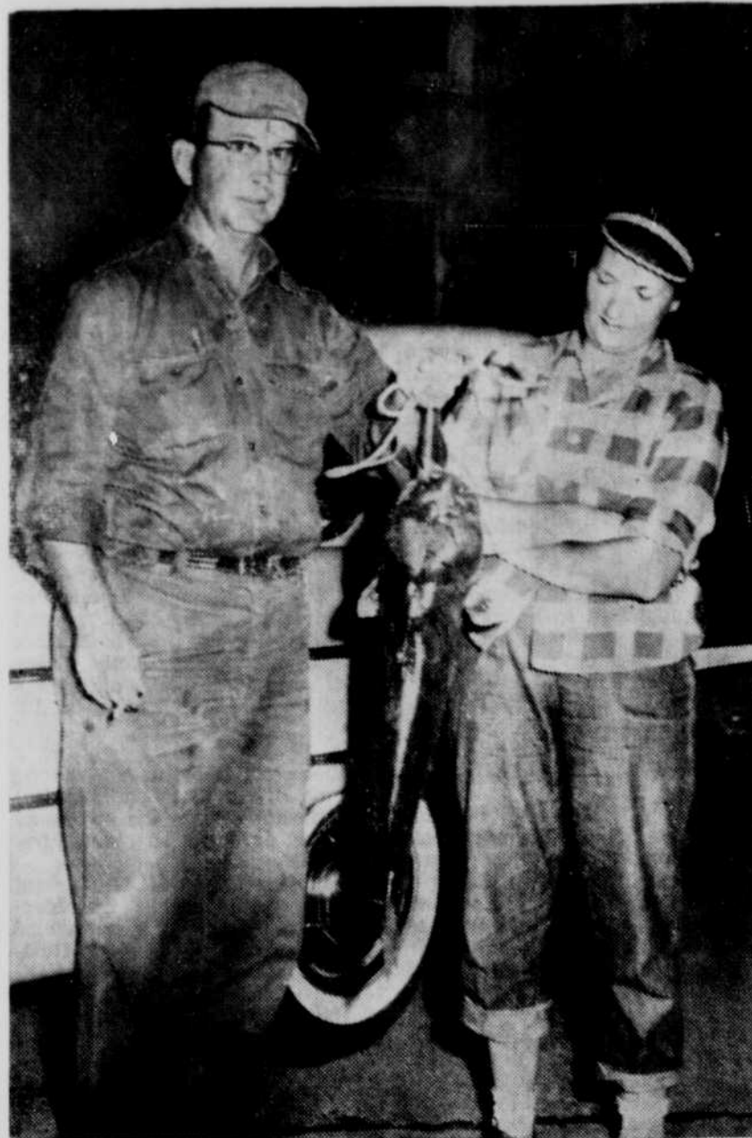
Big Catfish Hauled from Niobrara