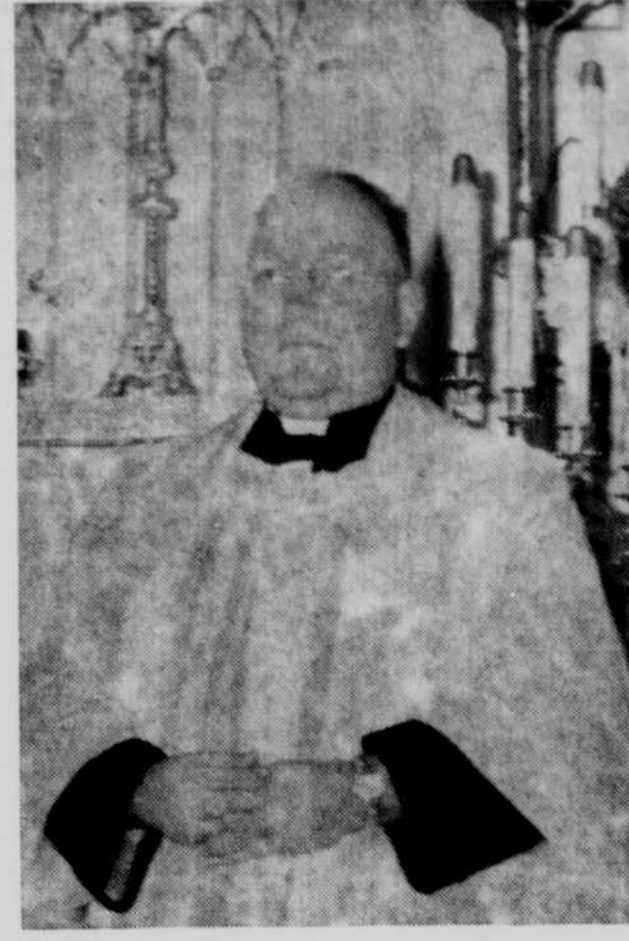
New Clergy Installed at Spencer