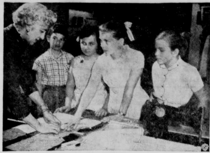
The technique of pattern alteration is explained to this group of teenagers, who are making dresses to compete in the Fifth Annual Singer Teenage Dressmaking Contest.

What's the most popular summer activity in the teenage set? Swimming? Picnicking? Not on your life. According to nearly a quarter of a million girls between the ages of 10 and 17, the best way to spend the summer is to enter the exciting Teenage Dressmaking Contest, sponsored annually by the Singer Sewing Machine Company.