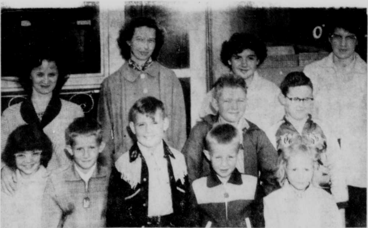
Dorsey Pupils Visit The Frontier