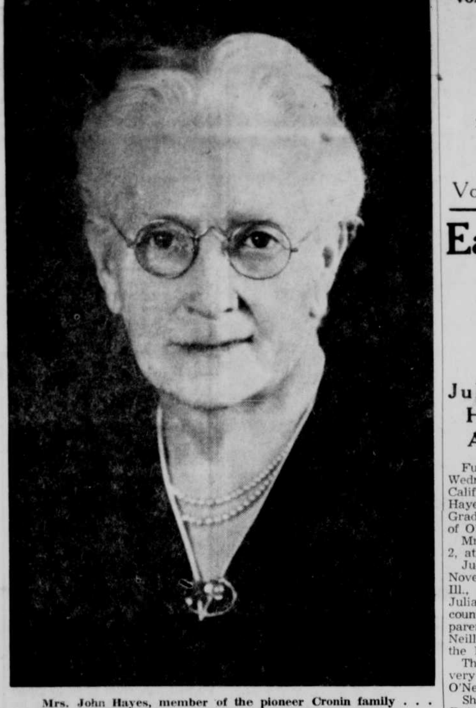
she came to Holt in 1876.