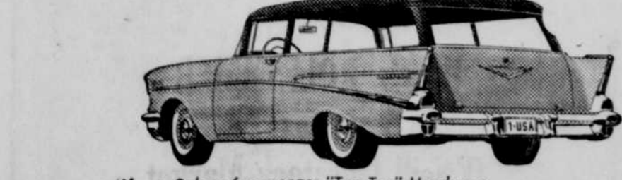
Above, 2-door 6-passenger "Two-Ten" Handyman.

Only franchised Chevrolet dealers display this famous trademark See Your Local Authorized Chevrolet Dealer